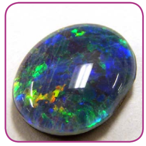
were also ground and ingested for their healing properties and to ward off nightmares.

A ncient monarchs treasured Opals, both for their beauty and for their presumed protective powers. They were set into crowns and worn in necklaces to ward off evil and to protect the eyesight. These gemstones